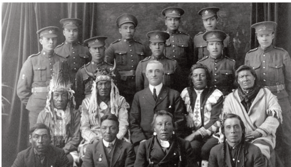
Veterans from Fire Hills, Sask.