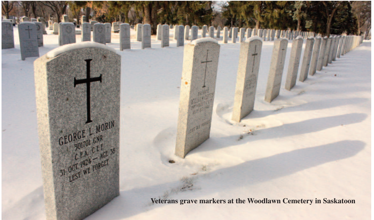
Veterans grave markers at the Woodlawn Cemetery in Saskatoon

One of the beneficiaries is a family from White Bear First Nation, in southeast Saskatchewan, who will be receiving a tombstone for their veteran father, who served in the Second World War. The family declined to comment for this story but were reportedly very grateful for the Fund's support.