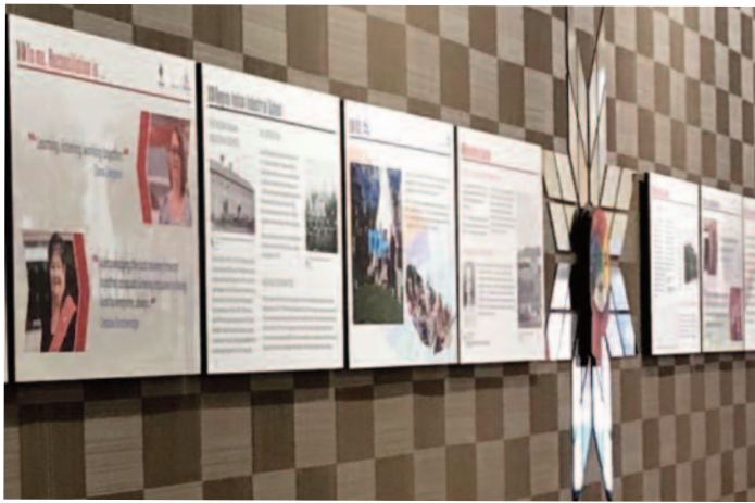
There are 14 panels that stretch 43 feet which is centred by a medicine wheel and star. Each panels integrates historical information on treaties and residential schools.